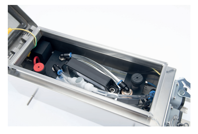
Lamp unit open

As system suppliers, Hönle und STERIXENE offer lamp units as well as bioindicators for a rapid analysis of disinfection rates in their own microbiological laboratory.